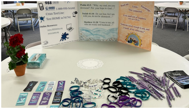
Sept. 7th was Suicide Prevention Sunday