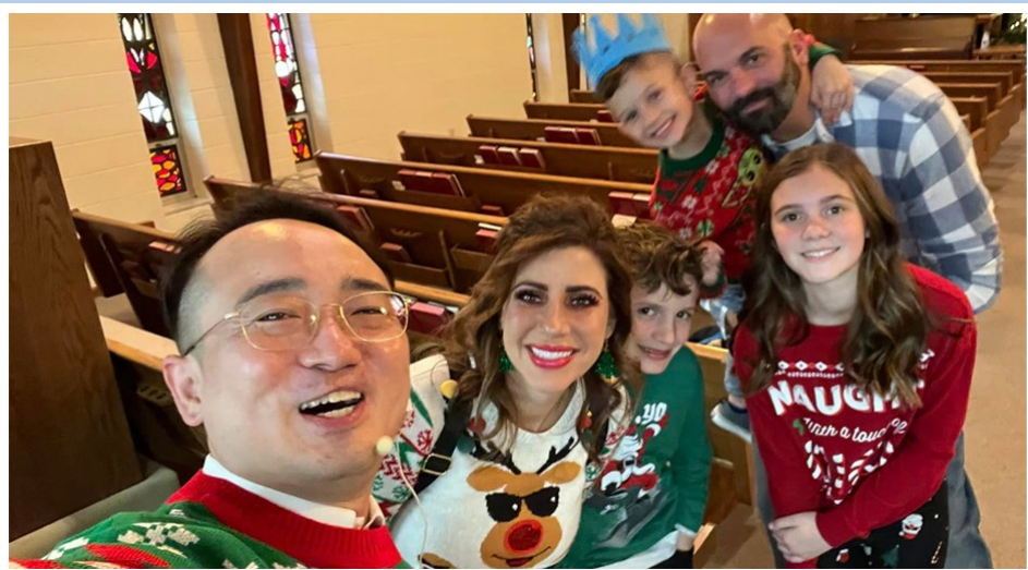
Ugly Sweater Sunday