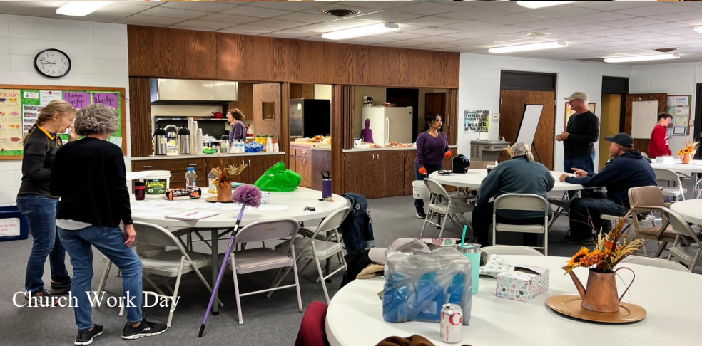
Church Work Day