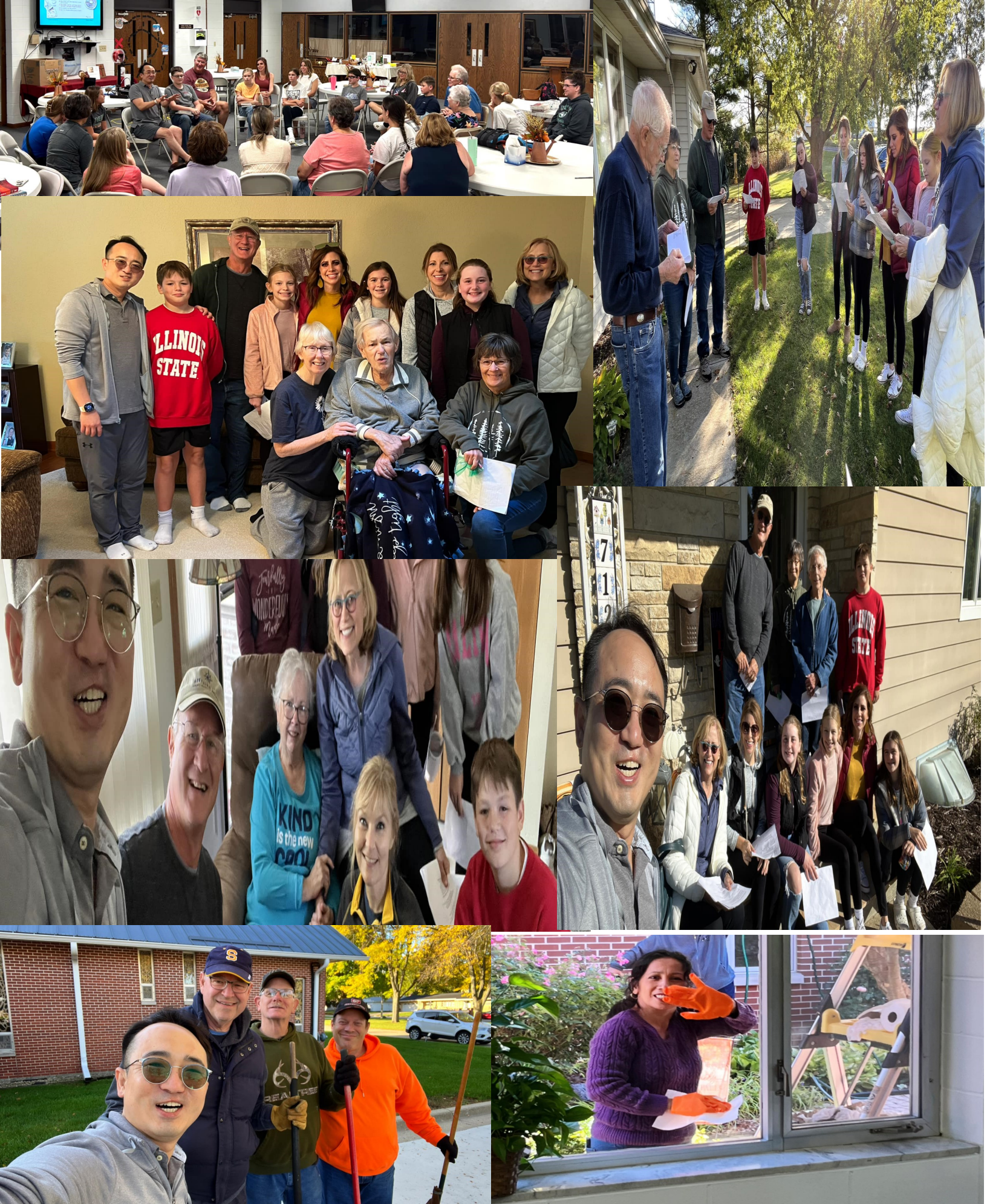
Confirmation class & Church Work Day