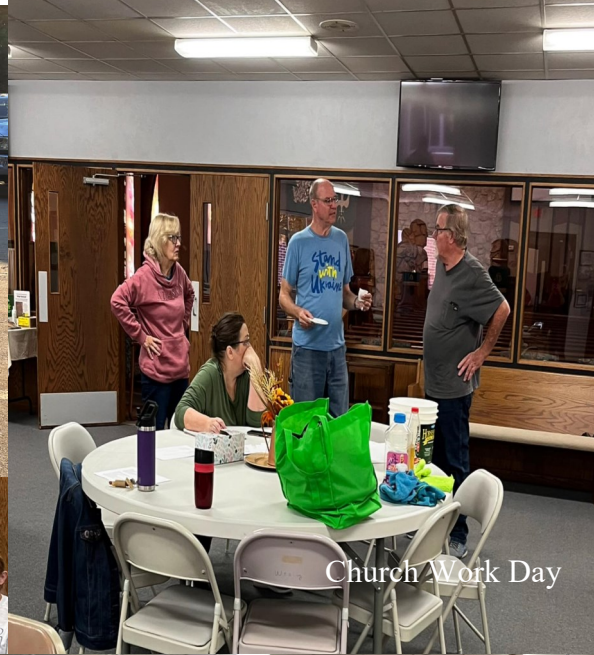
Church Work Day