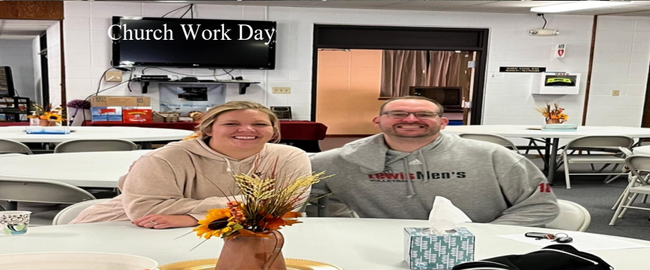
Church Work Day