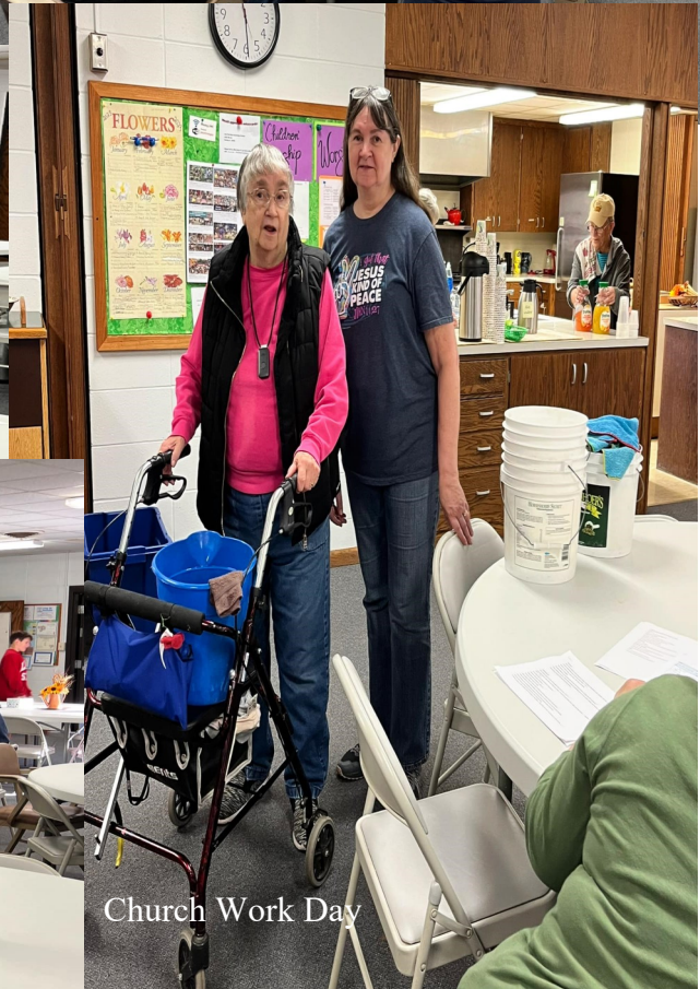
Church Work Day