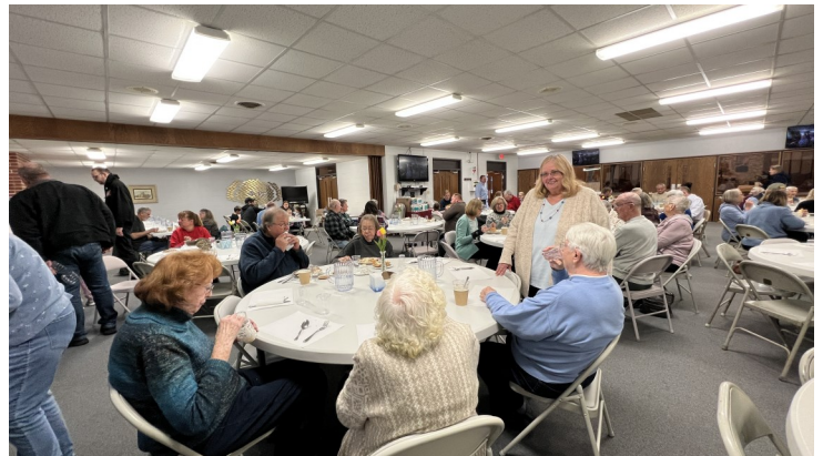
Men's Group Ham Dinner Held on Saturday, March 11th