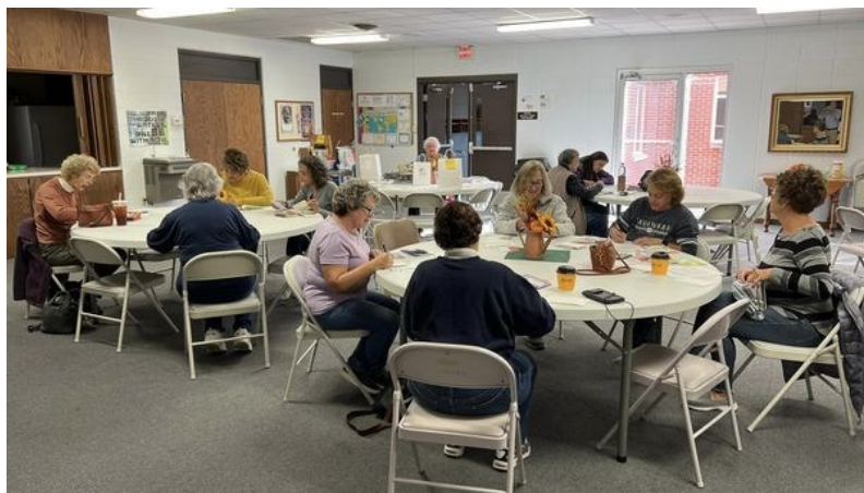
Member Care Ministries