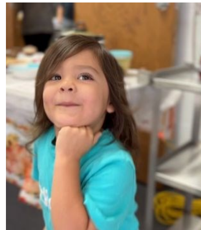
Chili Cook-off and Dessert Auction