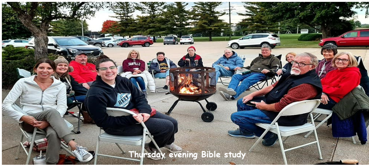
Thursday evening Bible study