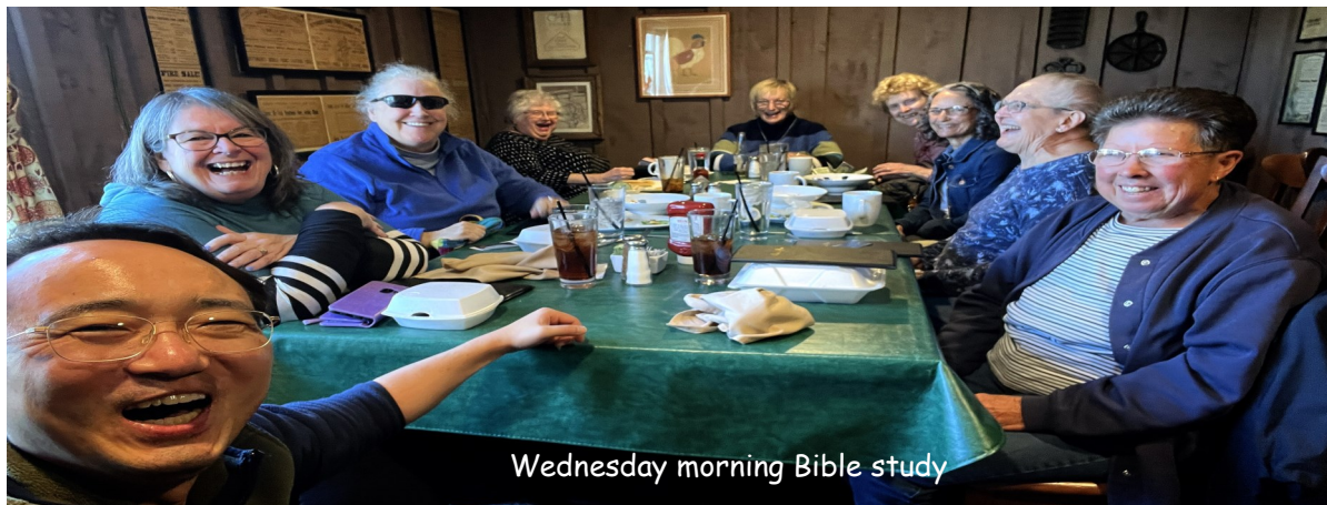
Wednesday morning Bible study