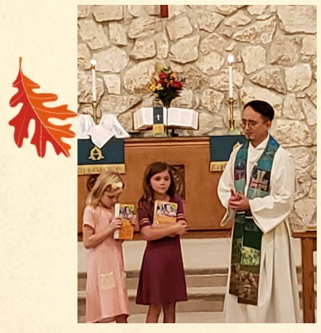
Sunday Service Blessings...