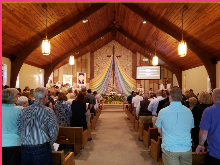
Easter Service at Wesley UMC, 2019

Theme: Christ does not walk with us in human form any more. Yet, the power of Christ is with us, and offered to us all. It's intimidating to be offered this power, but in using it, we find our true purpose from God. Will we accept and use the power?