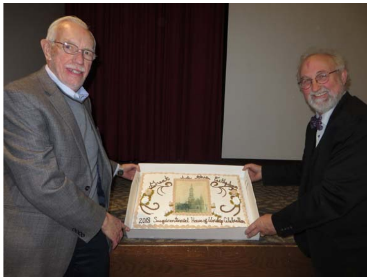
Photo taken at Illinois State Historical Society luncheon in Springfield, March 10th, 2018