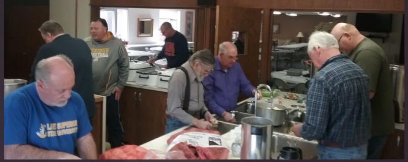
Above: Members of the Men's Club prepare potatoes for the annual ham dinner.