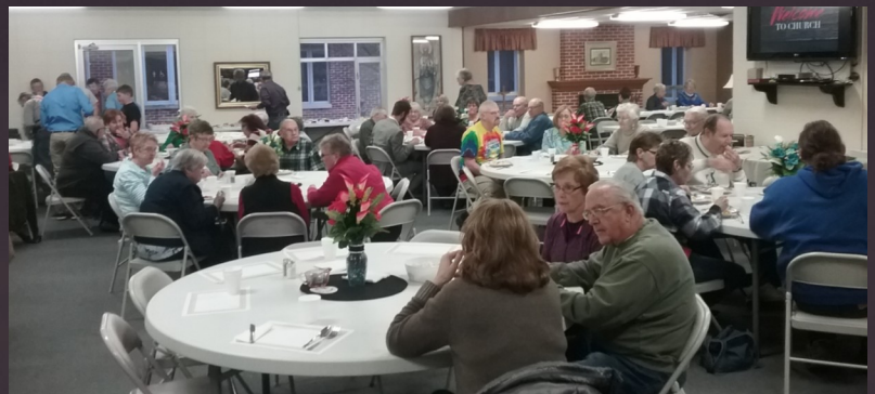
Above: Members and friends of Wesley United Methodist Church enjoy a dinner of ham, potatoes, beans, and more during the annual Men's Club Ham Dinner, held Saturday, March 11.