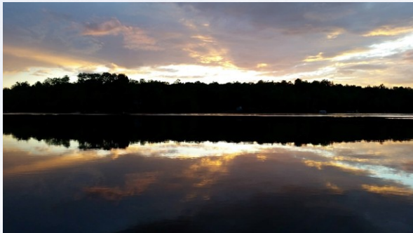
Crystal Lake in Mercer, Wisconsin