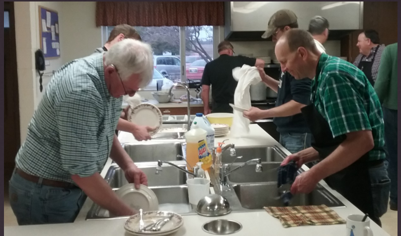
Below: Members of the Men's Club wash dishes during dinner.